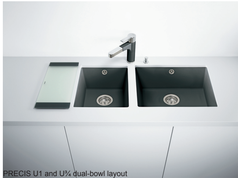
PRECIS U1 and U¼ dual-bowl layout

Made of ultra durable granite composite material, BLANCO SILGRANIT® combines 80% natural granite, with high-quality acrylic for unmatched strength and durability.